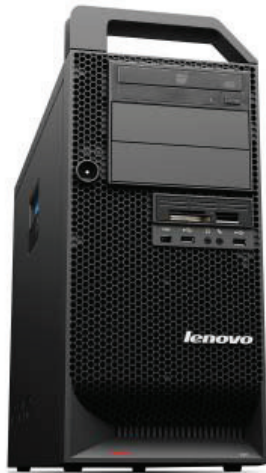
Lenovo ThinkStation D20