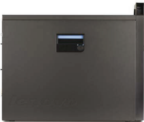
Lenovo ThinkStation D20