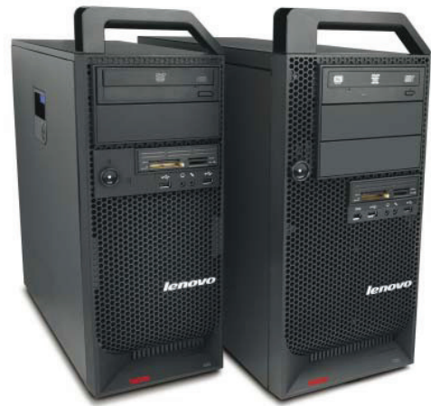
Lenovo ThinkStation S20 (left) Lenovo ThinkStation D20 (right)