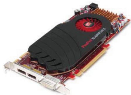
Lenovo ThinkStation Graphics Card ATI™ FirePro™ 1GB V7750 (51J0511)