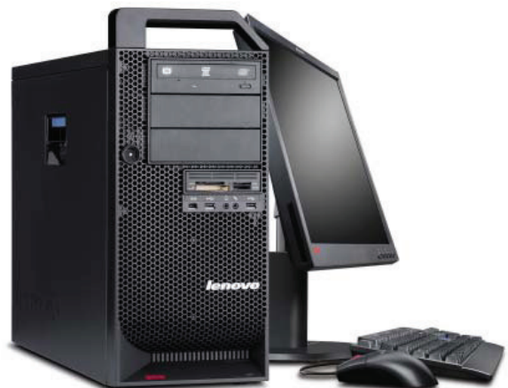
Lenovo ThinkStation D20 with Lenovo ThinkVision L2440 Monitor