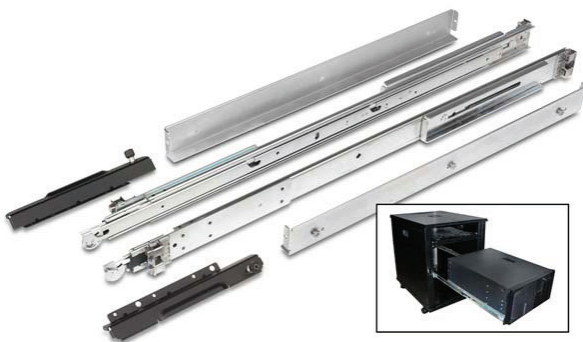
ThinkStation Rail Kit (43R1964)